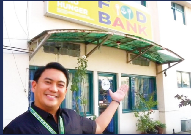
Cauayan City Mayor Bernard Dy promoted the city's food bank where food is stored and distributed to low income families to alleviate hunger