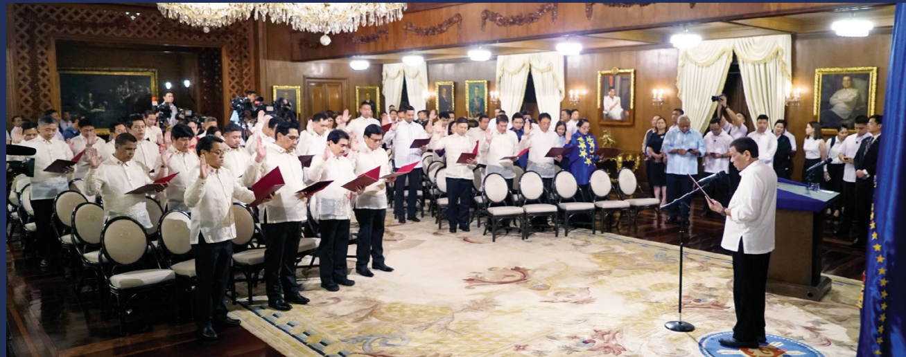
President Rodrigo Duterte administers the oath of office of newly elected LCP officers at the Malacañang Palace on 6 August 2019