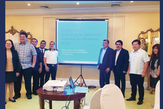
Former Senator and current President of the Manila Hotel Joey Lina (fourth from right) joins city mayors for a group photo at a caucus before the Malacañang meeting on 11 October 2019

According to Dominguez, giving in will breach the fiscal deficit ceiling and may trigger a downgrade in the