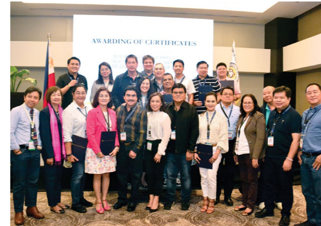
Members of the LCP executive board take a group photo with representatives from the DAP after the awarding of certificates

City mayors adopted the League of Cities of the Philippines Executive Agenda for 2019-2022 during the 69th National Executive Board (NEB) Meeting on 27 September 2019 at the dusitD2 Davao Hotel.