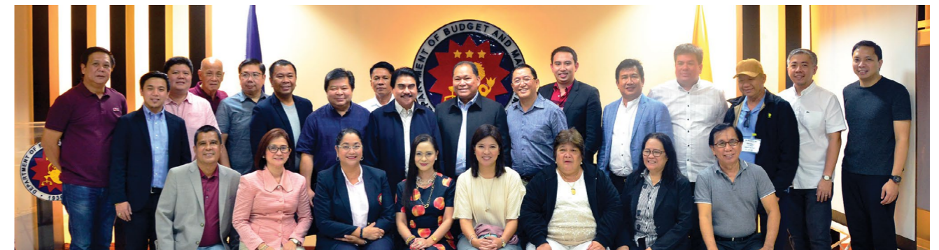
City mayors pose for a photo opportunity with Secretary Wendel Avisado (standing, tenth from left) after the executive session on 6 September 2019

The LCP met with Department of Budget and Management (DBM) Secretary Wendel Avisado to tackle certain regulatory and fiscal concerns of city governments at an executive session on 6 September 2019.