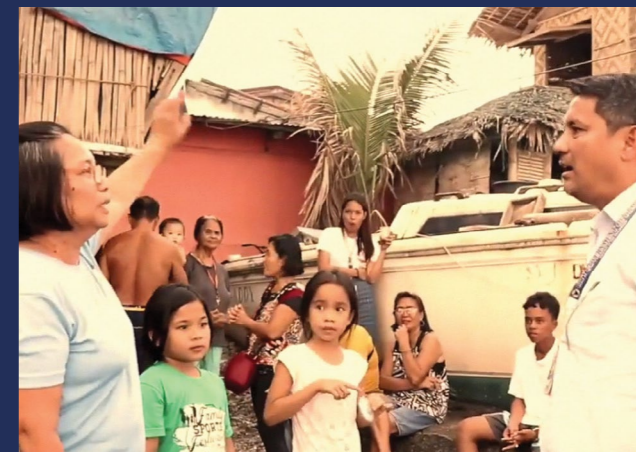
Mayor Richard Gomez conducts local consultations in a climate-vulnerable community in Ormoc City