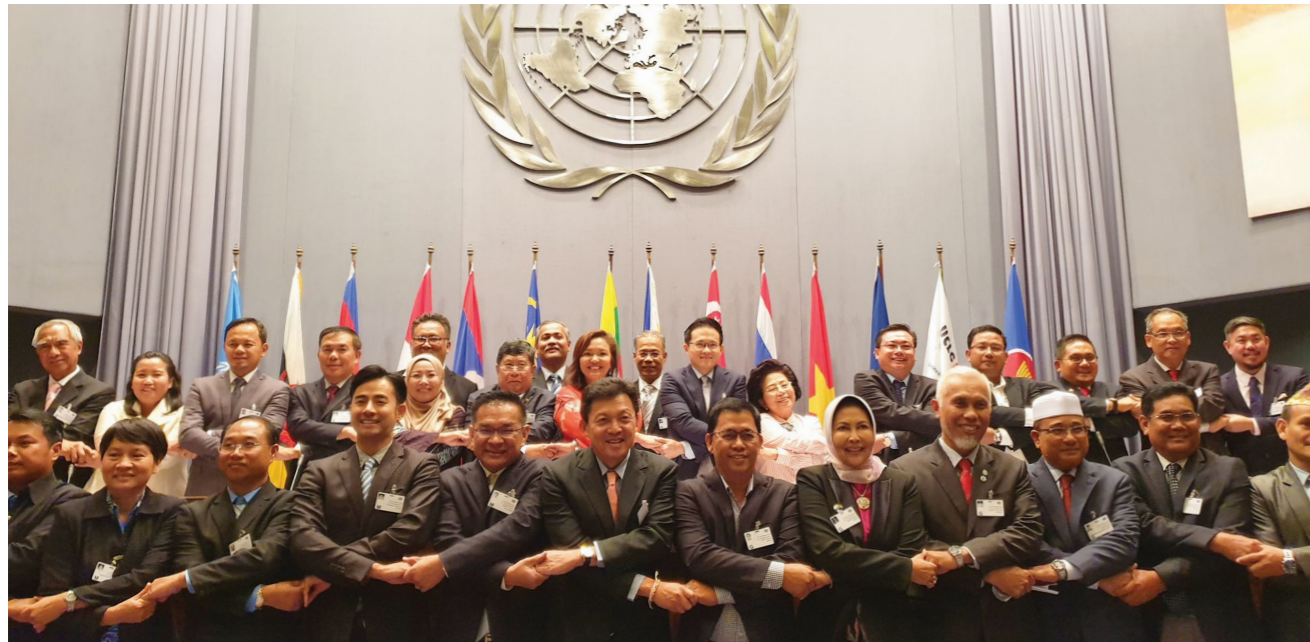
Philippine city mayors join the rest of the ASEAN delegates for a group photo after the reading of the ASEAN Mayors' Declaration on 27 August 2019

In keeping with its commitment to support the urban ASEAN community at large, the League, through its members, attended the fifth ASEAN Mayors Forum (AMF) on 26-28 August 2019 at the United Nations Conference Centre in Bangkok, Thailand.