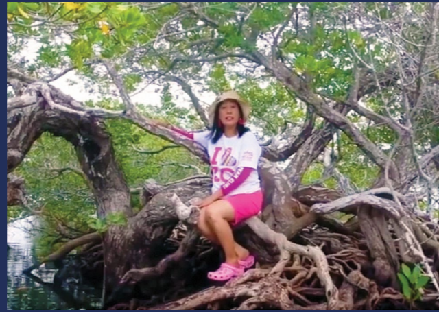
In her challenge video, Zamboanga City Mayor Beng Climaco gives a tour of Santa Cruz Island where protection and conservation efforts are ongoing