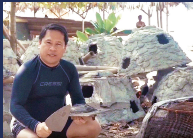
Tagum City Mayor Allan Rellon builds artificial coral reefs to support fish population in his city

Legazpi City Mayor Noel Rosal accepted Gomez's nomination by leading a back-to-back community coastal cleanup and mangrove tree planting activity participated by city government employees and local townsfolk.