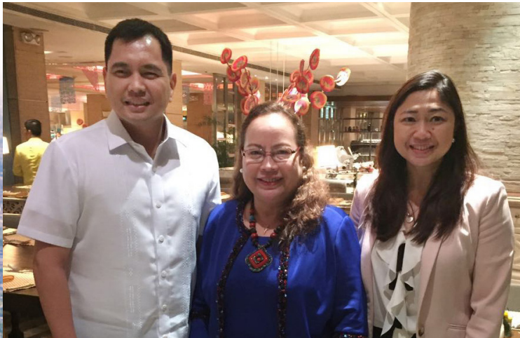
LCP Leaders meet with Secretary Benjamin E. Diokno of the Department of Budget and Management and Secretary Paulyñ Jean B. Rosell-Ubian of the Department of Health for a dialogue to discuss various issues of City Local Governments.