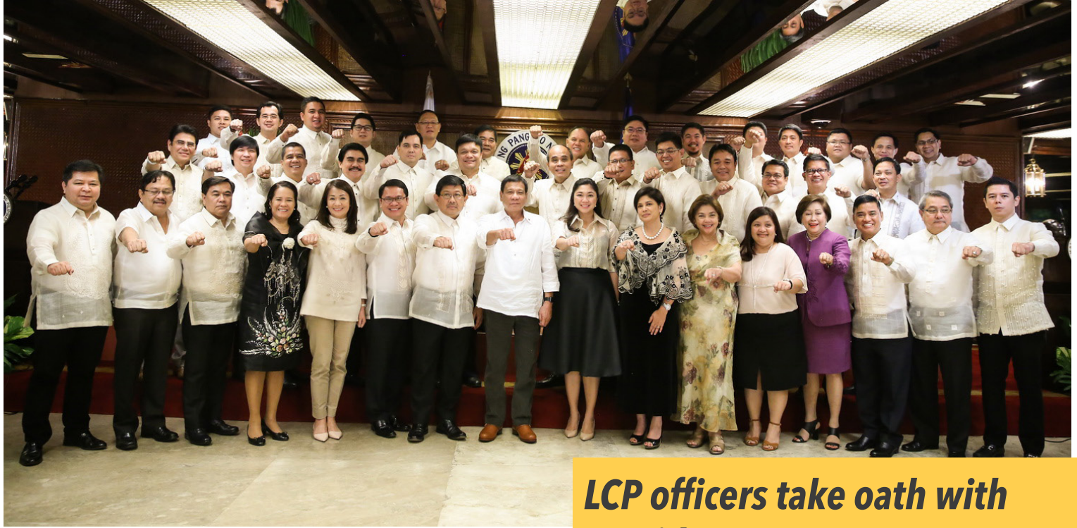
LCP officers take oath with President Duterte President Rodrigo Roa Duterte leads the oath-taking of the newly-elected officers of the League of Cities of the Philippines in a ceremony at Malacanang Palace on 27 July 2016.