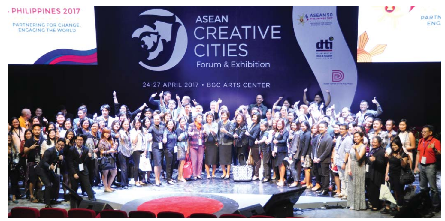
The ASEAN Creative Cities Forum Exhibition was organized by the Department of Trade and Industry and the Design Center of the Philippines.

call for the UNESCO Creative Cities Network (UCCN).