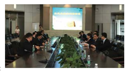
At Shenzhen Hi-Tech Industrial Park, the mayors took part in an educational briefing attended by representatives who discussed SHIP's major contribution to the economic growth of China.