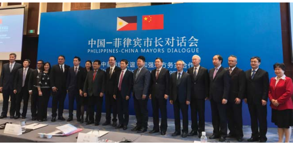
Philippine city mayors with local chief executives from China at the Philippines-China Mayors Dialogue held last April 19, 2017 in Guangdong

At Shenzhen Hi-Tech Industrial Park (SHIP), the mayors took part in an educational briefing attended by representatives from the industrial park who discussed SHIP's history and its major contribution to the