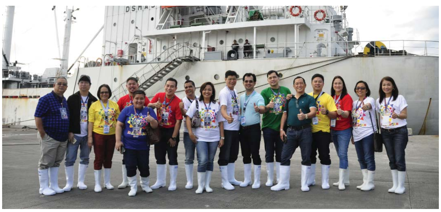
LCP Mayors were given a tour of the GSC Fish Port Complex on February 22, 2017.

The LCP, in cooperation with the City Government of General Santos, held its mayors were very enthusiastic and 61st National Executive Board Meeting eager to contribute in exchanging on February 21-22, 2017 in General Santos City.