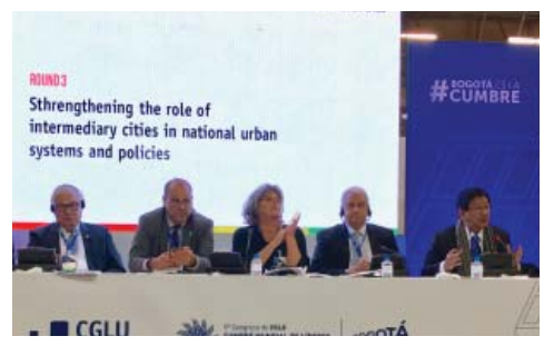
Angeles City Mayor Edgardo Pamintuan was invited to be one of the session speakers at the UCLG conference.