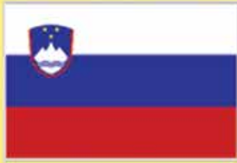
SLOVENIA Academic Folk Dance Group "OZARA"