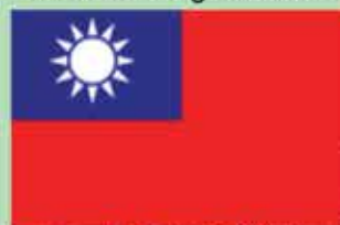
CHINESE TAIPEI The Lan Yang Dancers

The Group was called upon to cultivate the musical and vocal traditions of its land - Wielkopolska and some subregions such as Szamotuły, Biskupizna, Dąbrowka Wielkopolska, also Bambrzy - inhabitants of former villages of Poznan.