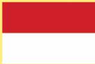
INDONESIA IOV Indonesia Youth Section

Academic folk dance group Ozara Kranj has been lovingly keeping and sharing Slovenian dances, music and songs for over 60 years. The group performs for local community and for the needs of other parts of Slovenia as well.