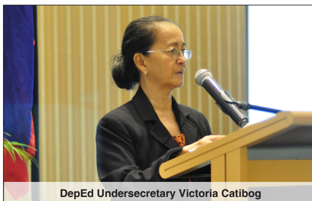
DepEd Undersecretary Victoria Catibog

Voucher values vary depending on location, type of cities, and where the grade 10 completer will enroll. Grade 10 public school completers in NCR enrolling in a private college are given P45,000 per year subsidy. On the other hand, Grade 10 completer from private school in NCR enrolling in a private college is given P36,000 pesos as subsidy. Grade 10 completers in NCR whether from private or public schools enrolling in a state college or university or local college and university are given P22,500 as yearly subsidy.